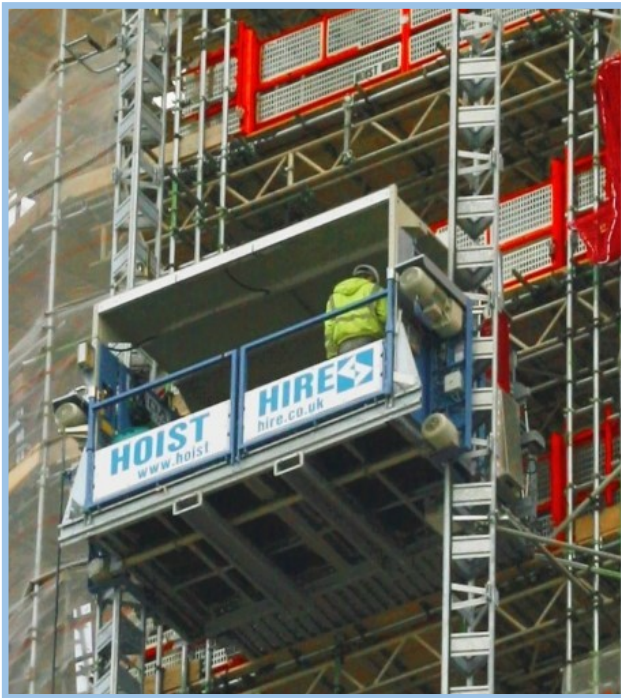
'ED' PLATFORM PICTURED

One device, numerous possibilities: the double-mast GEDA 1500 Z/ZP transport platform ideally adapts to virtually any conditions on site thanks to the convenient modular system with different platform versions and different load capacities.